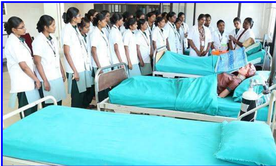
Fundamental Nursing Lab Teaching