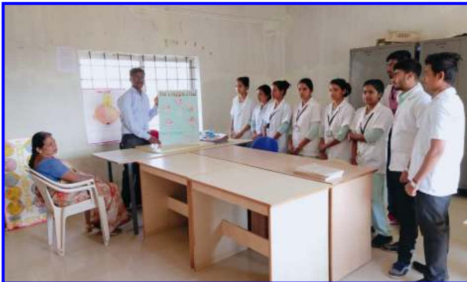
Clinical Teaching by Doctors